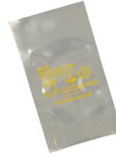
Foil-High Barrier, Aluminum-Low Barrier