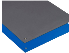
Rubber (soldering), Vinyl Dual or Three Layer all widths, Up to 50'