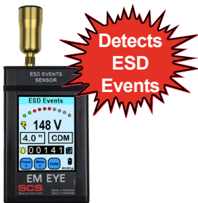
EM Eye - ESD Event Meter