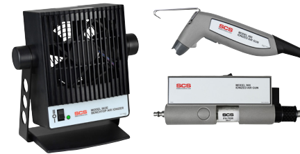
Benchtop, Overhead, Air Gun