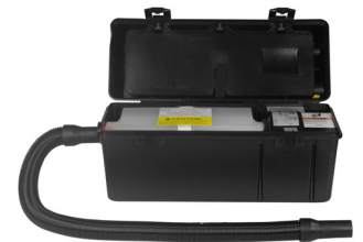
Electronic Service Vacuum